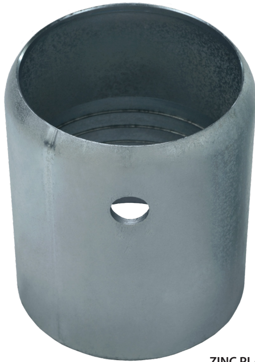
ZINC PLATED STEEL